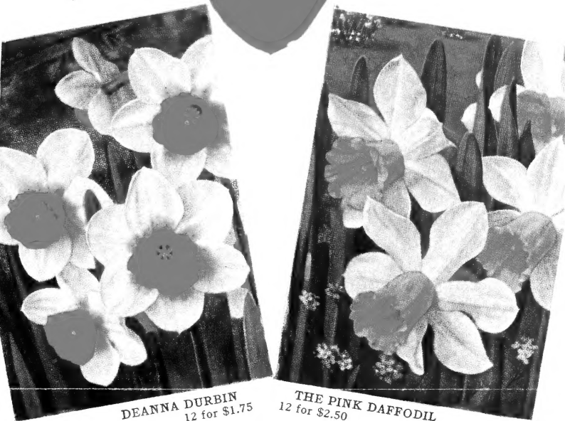
DEANNA DURBIN 12 for $1.75